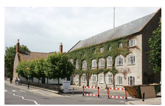
Figure 65: The Court, Court Mills.