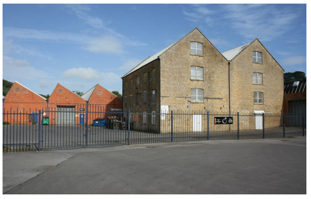
Figure 67: Warehouse and north-light sheds at North Mills.