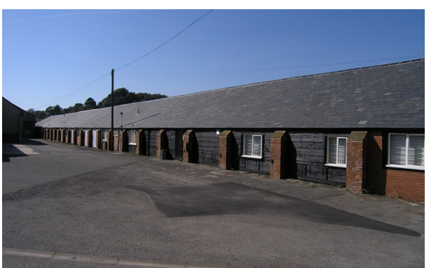
Figure 68: Covered Ropewalk, North Mills.