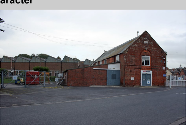
Figure 66: Industrial buildings at Court Mills.

Industrial Buildings: West Mill, The Court, Court Mills Engineering Workshop, North Mills warehouse, North Mills covered rope walk.