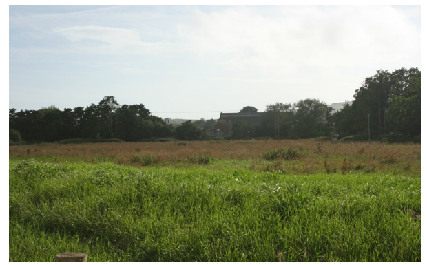
Figure 63: View over meadows from North Mills.

The plan elements of this area largely date from the 19th century but contain some earlier elements. West Mill at the southern edge of the area may be medieval in origin and North Mills has its origin as a water powered corn mill on the river and may be the site of the mill at Allington mentioned in Domesday. Court Mills