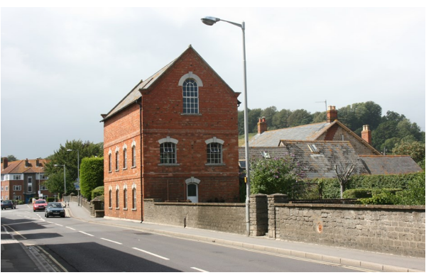
Figure 69: West Mill.