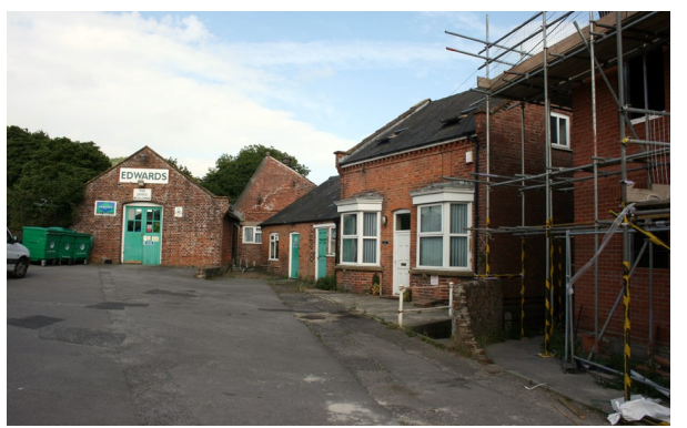
Figure 64: Edwards net factory, North Mills Road.

There is no coherent settlement pattern and most roads in the area provide access to North Mills or Court Mills only. North Mills Road accesses the North Mills complex from the east, with a bridge across the river. There is a number of workshops and worker's housing adjacent to North Mills on North Mills Road. The rest of the road has medium density suburban housing along its length.