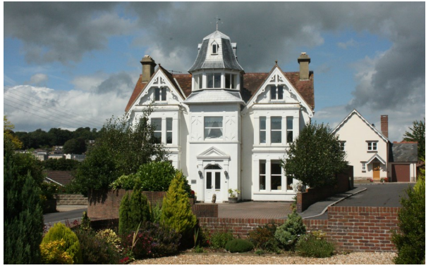
Figure 173: Nordons, 51 Crock Lane, Bothenhampton.