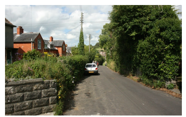
Figure 171: View down Crock Lane, Bothenhampton.

Figure 170 shows the present day historic urban character types. This area is dominated by Modern Housing Estates with smaller areas of Inter-war Suburban Estates, Suburban Villas and Modern Infill. There is a small area of Historic Rural Settlement at Wanderwell Farm.