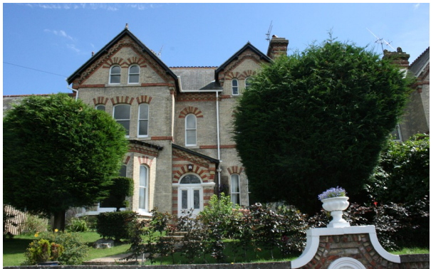
Figure 172: 13-15 Crock Lane, Bothenhampton.

The key buildings are Nos. 1-3 Crock Lane, Nos. 13-15 Crock Lane, Nos. 17-33 Crock Lane, Nordons, and Wanderwell Farm.