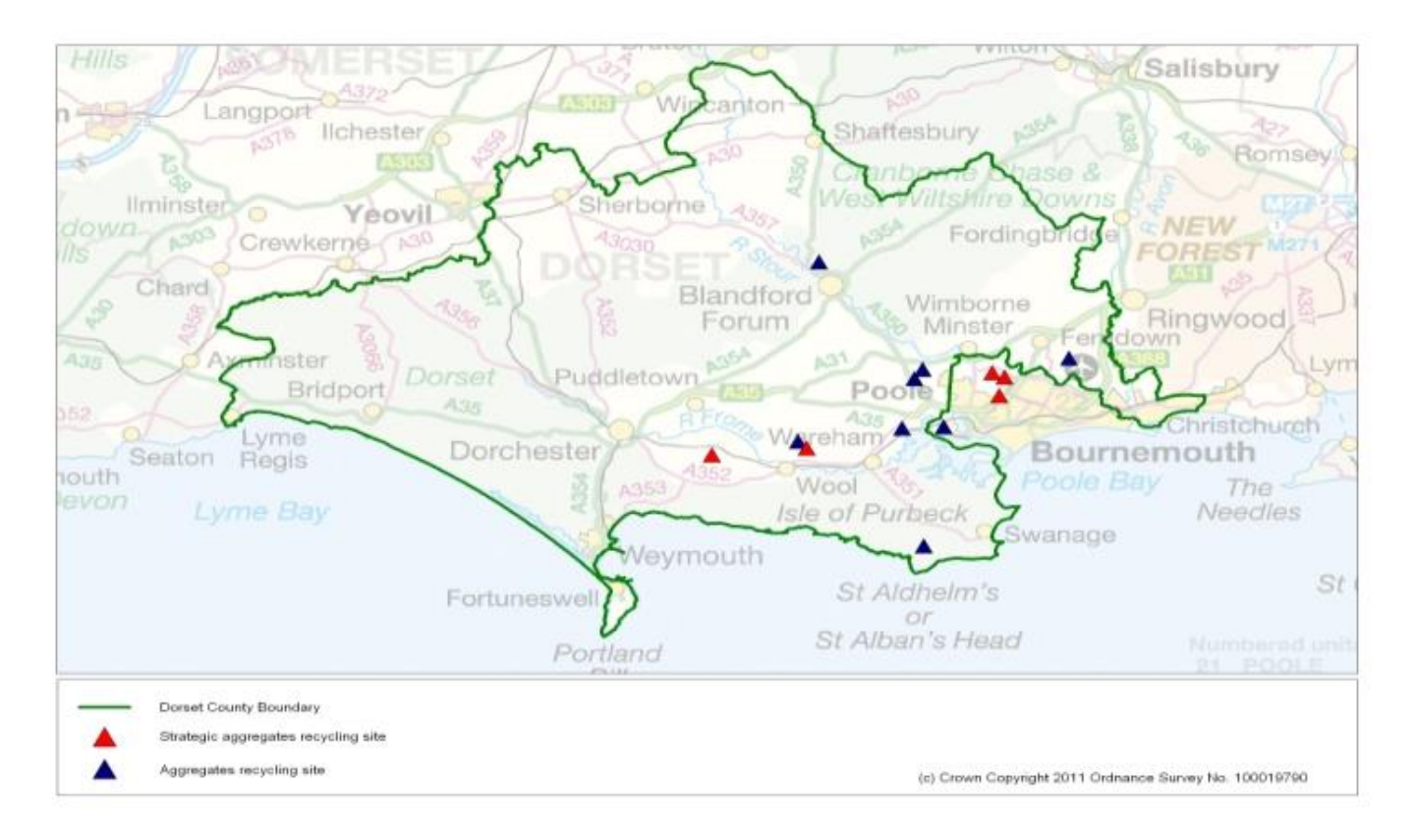
Figure 2: Aggregate Recycling Facilities