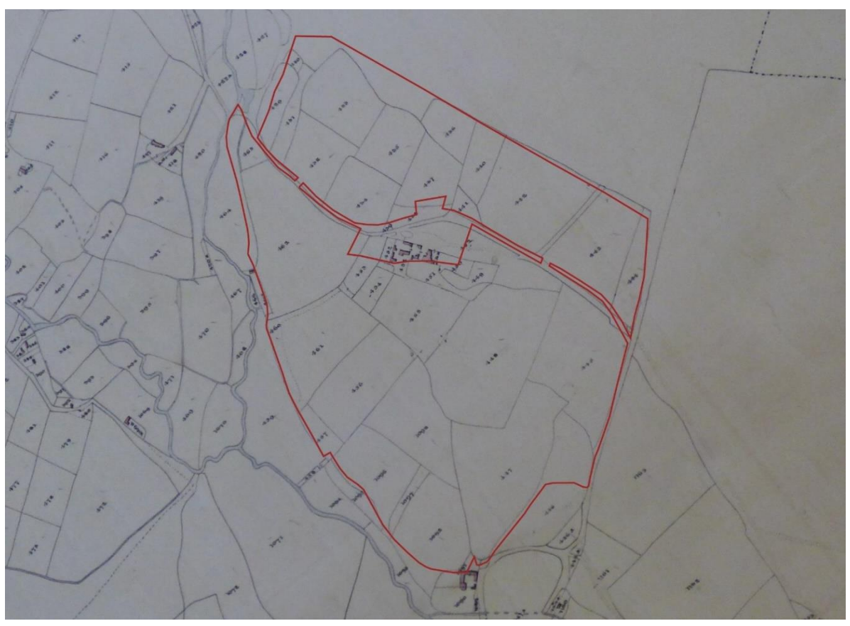
Plate 1. Bere Regis Tithe map 1844