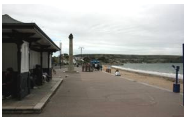
Figure 89: Seafront with Edwardian shelter and Alfred Monument.

The area is characterised by its open space, with good views of the sweeping sandy beach and bay, with the municipal planting along the recreation ground and Sandpit Field forming a backdrop behind the beach, screening parts of the suburban development behind.