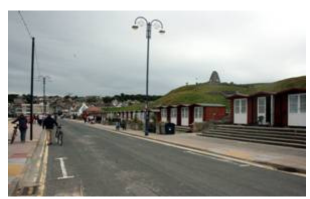
Figure 93: Beach huts along Shore Road.