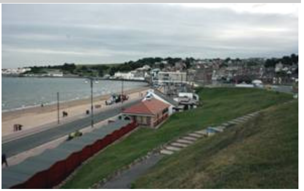
Figure 91: The White House and other buildings along Shore Road, viewed from the Recreation Ground.

Alfred Monument; seaside shelters, The White House, Bandstand, gun emplacement in Sandpit Field.