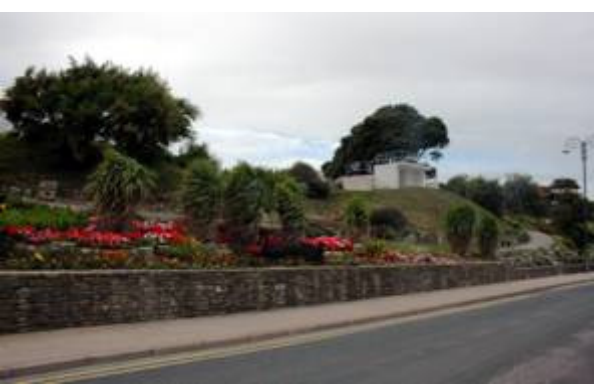
Figure 90: Sandpit Gardens with WW2 gun emplacement reused as public shelter.