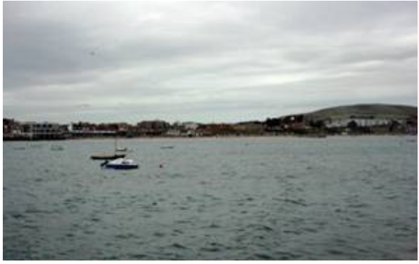
Figure 87: View of seafront from pier.