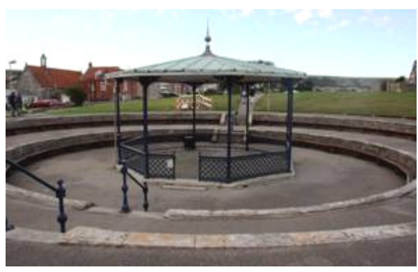
Figure 92: Recreation Ground bandstand.