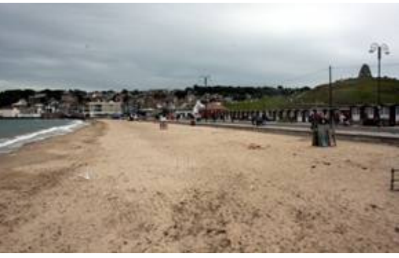
Figure 88: View along beach towards the Mowlem, with Recreation Ground on the right.