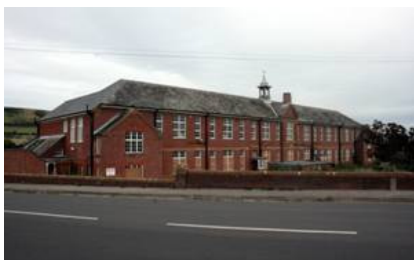
Figure 32: Swanage Grammar School.