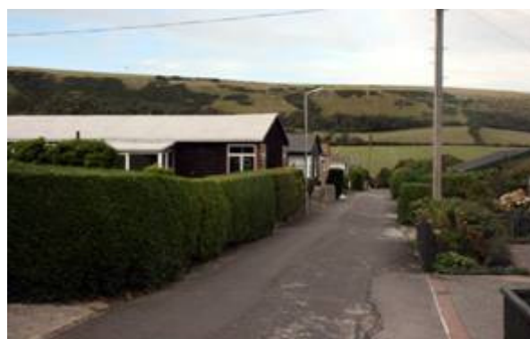
Figure 33: Ballard Down estate, created from a First World War army camp.