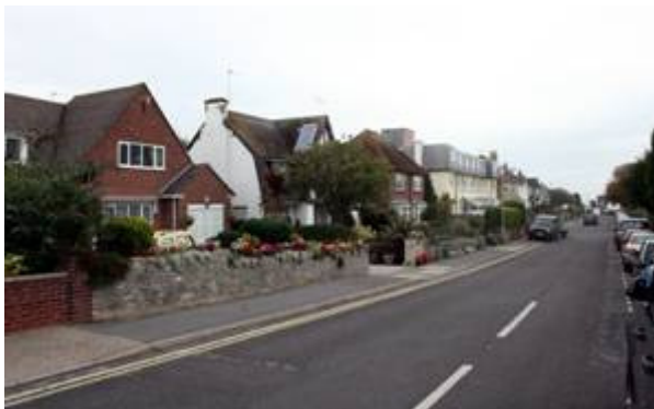
Figure 25: Inter-war suburban housing on Cauldon Avenue.

The coming of the Second World War saw great changes to Swanage. The visitors