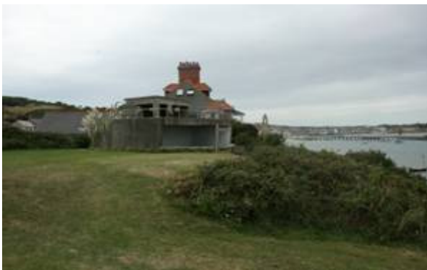
Figure 29: World War 2 coast battery, Peveril Point.

43. Durlston Dairy Farm . There were no significant changes during this period. It was demol-