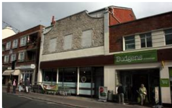
Figure 27: The former cinema on Station Road.

2. High Street . There was relatively little new