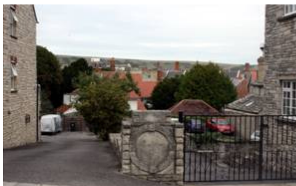
Figure 28: Site of Wesley's Cottage, High Street, destroyed during a Second World War air raid.

19. Congregational Chapel . There were no major changes to the chapel during this period.