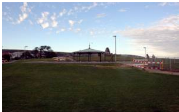
Figure 26: The bandstand and recreation ground on the site of the former Eastbrook Farm.