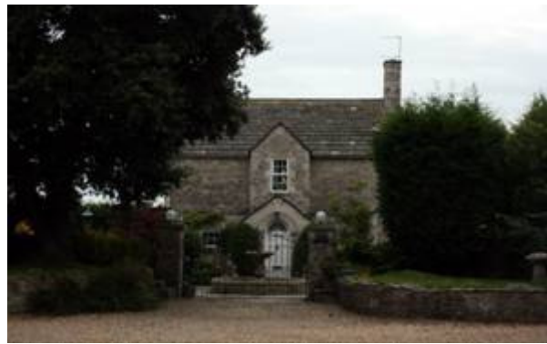
Figure 30: Scar Bank House.