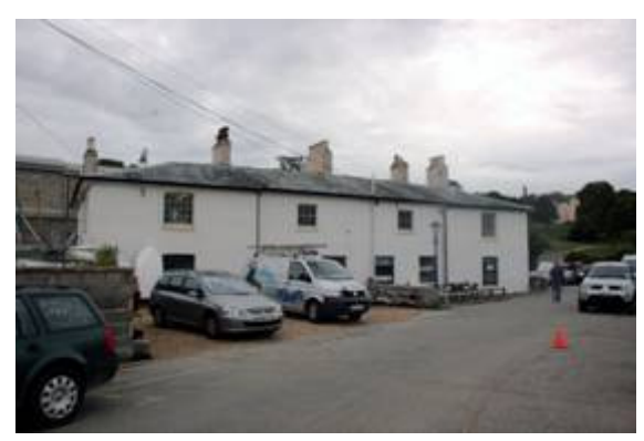
Figure 12: Marine Villas.

There were two nonconformist chapels in Swanage in the early 19<sup>th</sup> century, both on the High Street. The Wesleyan Methodist Chapel was built in 1805. The Independent Chapel, built in 1705 as a Presbyterian meeting-house, was replaced by a new Congregational chapel