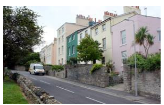
Figure 14: Tontine Houses on Seymer Road.