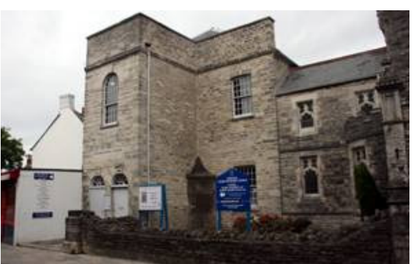
Figure 15: Congregational Chapel, built 1837.