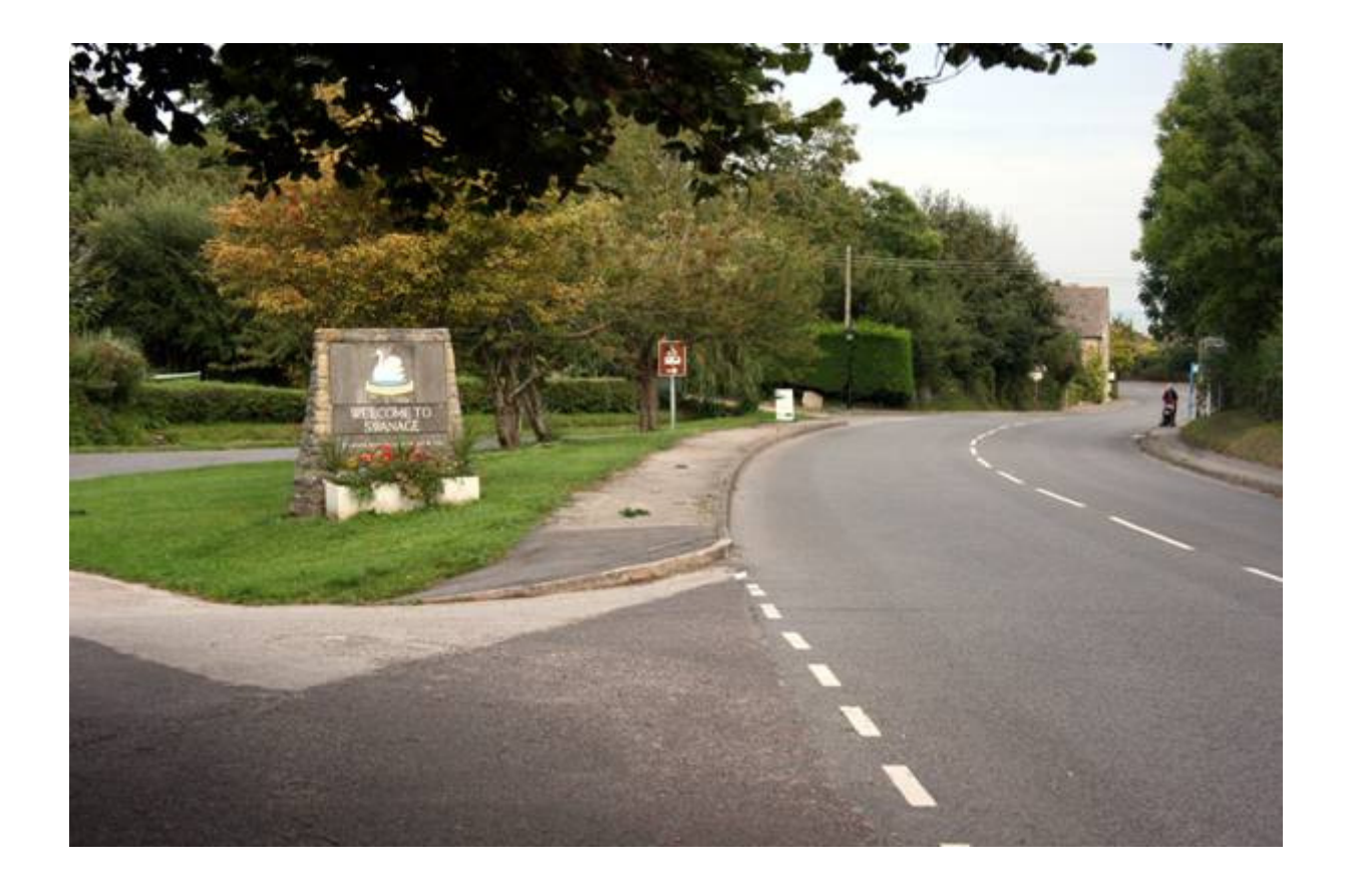
Part 1: Introduction