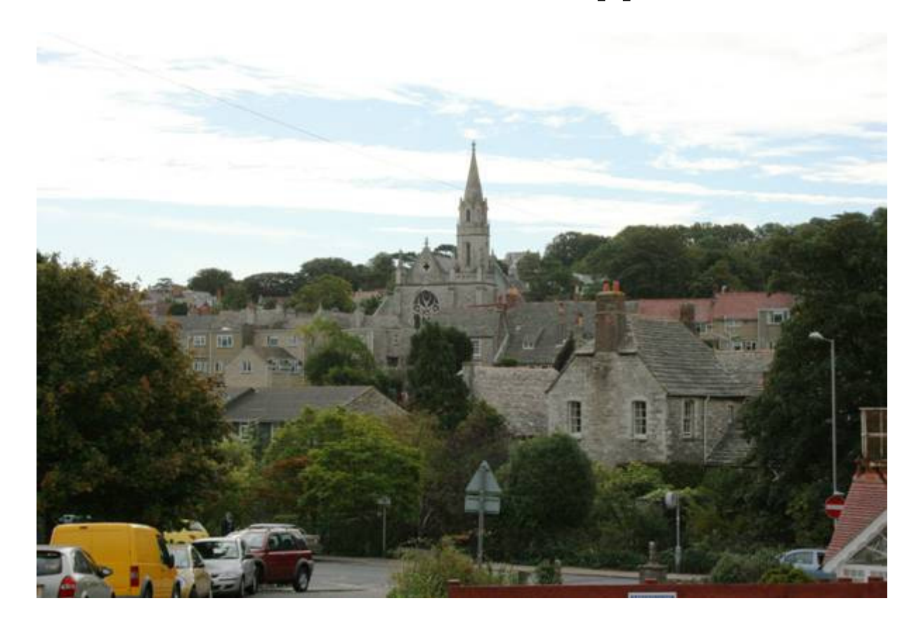
Part 2: Overview of Approach