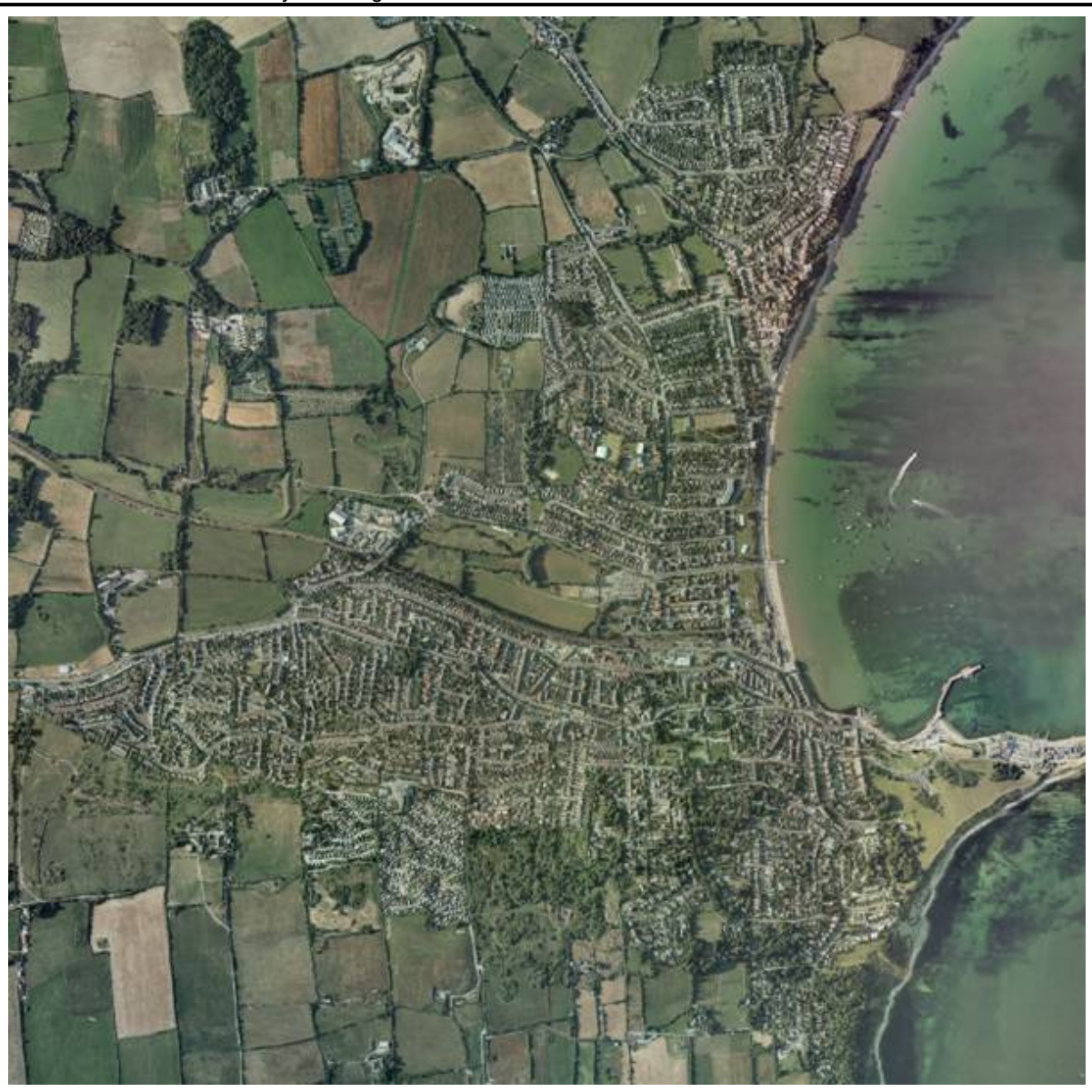
Figure 1: Vertical aerial photographic view of Swanage, 2005 (© Getmapping.com, 2005).

slopes which give good views over the wide curving bay and sandy beach of Swanage Bay.