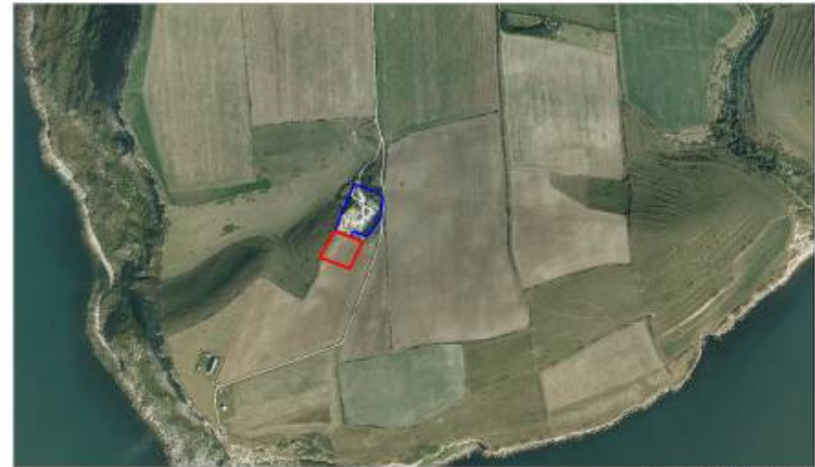
PK11 - St Aldhelms Quarry - Aerial View

Site was granted planning consent on 01 April 2015.