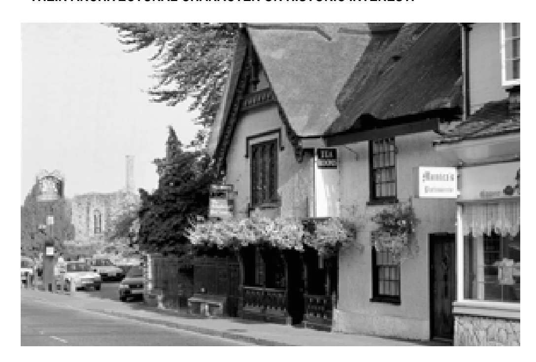
The Old Perfumery, Castle Street