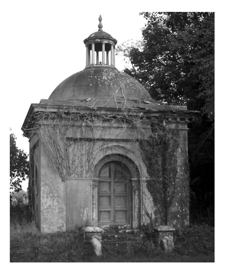
Manston mausoleum, built to store bodies for Britain's first cremations.

In those days it was a small self-sufficient agricultural community contained in one big field next to the river where villagers farmed, fished and milled corn for flour. This original village now lies buried under the field adjacent to the church. Legend has it that plague struck and caused the original settlement to perish.