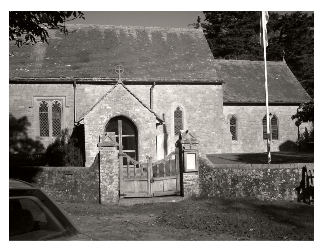
St. Paul's church, Hammoon

St. Paul's was built in the late 12<sup>th</sup> early 13<sup>th</sup> centuries. The north wall of the Nave is the earliest remaining part of the church, and is constructed of Hamm Hill limestone. The church has a register dating back to 1656.