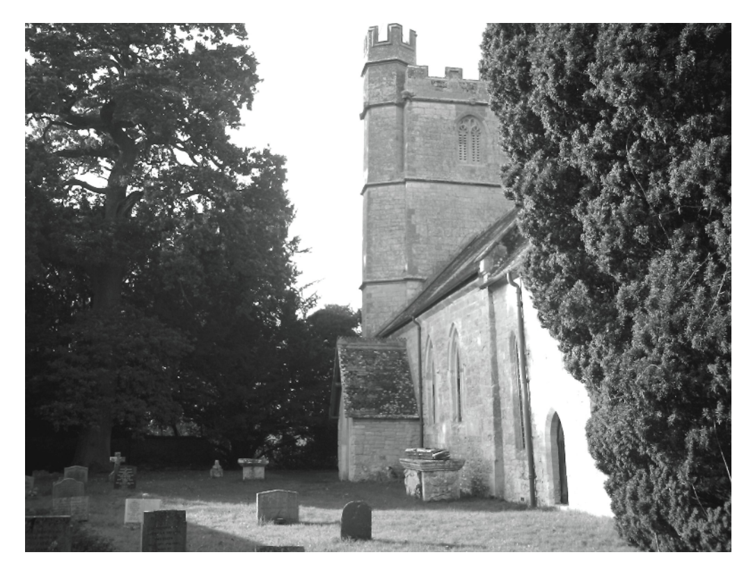
St. Nicholas church, Manston

A modern abattoir, serving the local area, is situated on the outskirts of Manston and there are a number of small businesses based within the villages. However, all services (such as schools, doctors, dentists, shops, garages, etc.) must be obtained from larger settlements such as Sturminster Newton, Child Okeford, Gillingham and Shaftesbury. Public transport is confined to a very limited bus service and access to Nordcat.