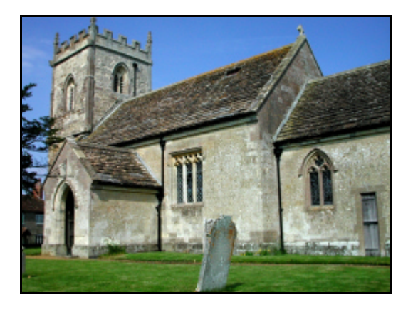
PARISH ACTIVITIES, FACILITIES AND FINANCE

In light of the numbers normally attending, a surprisingly large number of residents value the parish church for its religious functions; but, whether or not they attend, a majority values it as a fixture of the community. This is not surprising: the church is one of only three community resources remaining in the parish (the others are the cricket pavilion and public house).