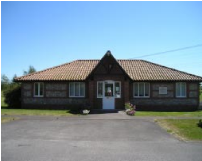
Fontmell Magna Surgery