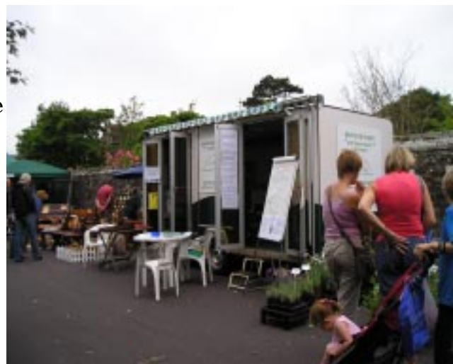
Gold Hill Fair 2005

All the documents and reports that form the evidence base of the CSP are available for inspection at the Task Force offices, Longmead, Shaftesbury.