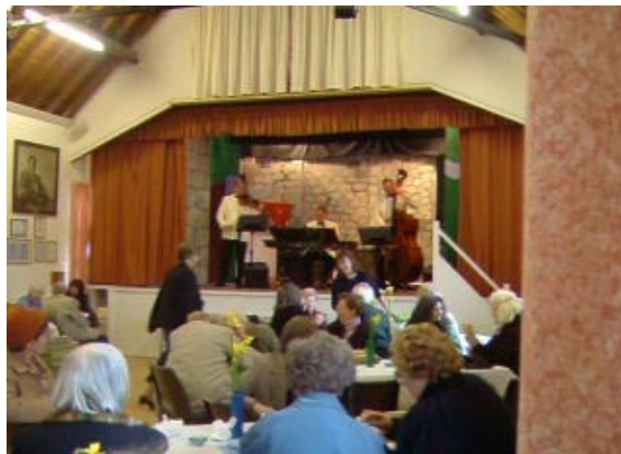
'We'll Eat Again' - Motcombe