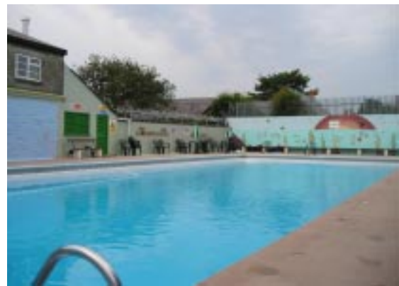
Shaftesbury Swimming Pool

In addition, the lack or inconsistency of public transport makes it difficult or impos-