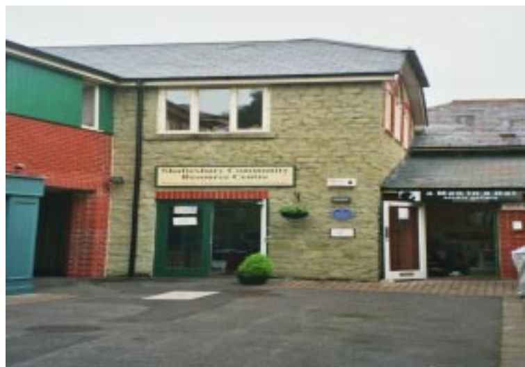
Swans Yard Community Office

and community groups. This will enable them to come together to have a voice in decision-making in strategic partnerships across Shaftesbury area and, in particular, assist them to secure appropriate resources to develop their own structures and projects.