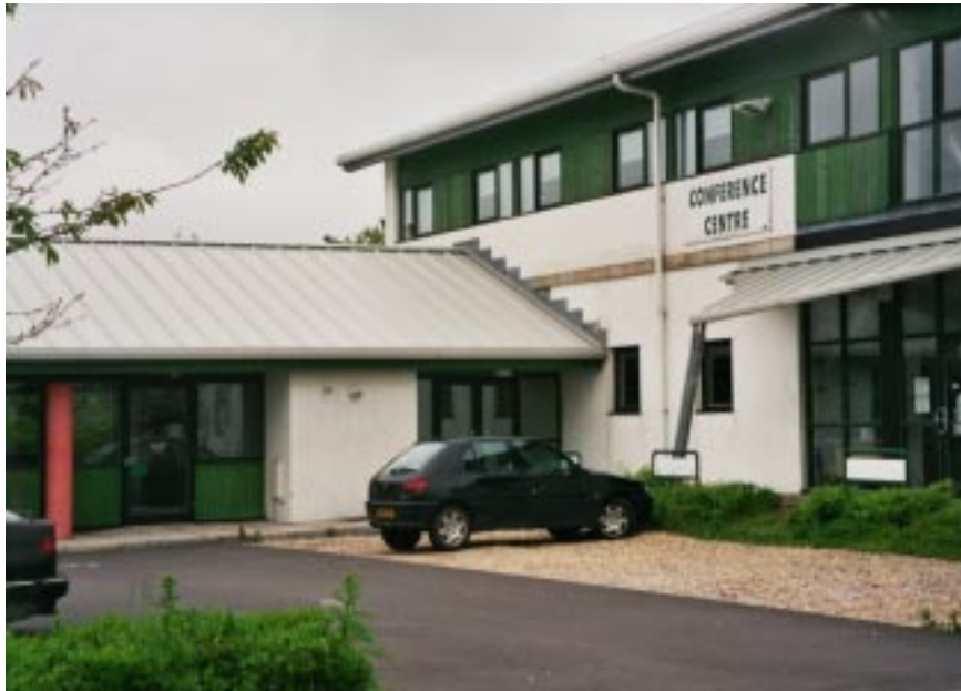
Wincombe Business Park

Approximately 13% of Shaftesbury's businesses are centred in manufacturing and 6% of our rural areas economy is in agriculture. Both these industries are in decline. Small retail businesses in the rural areas, such as post offices, are closing and other local businesses, such as pubs, are becoming unviable with many premises being turned from business to residential.