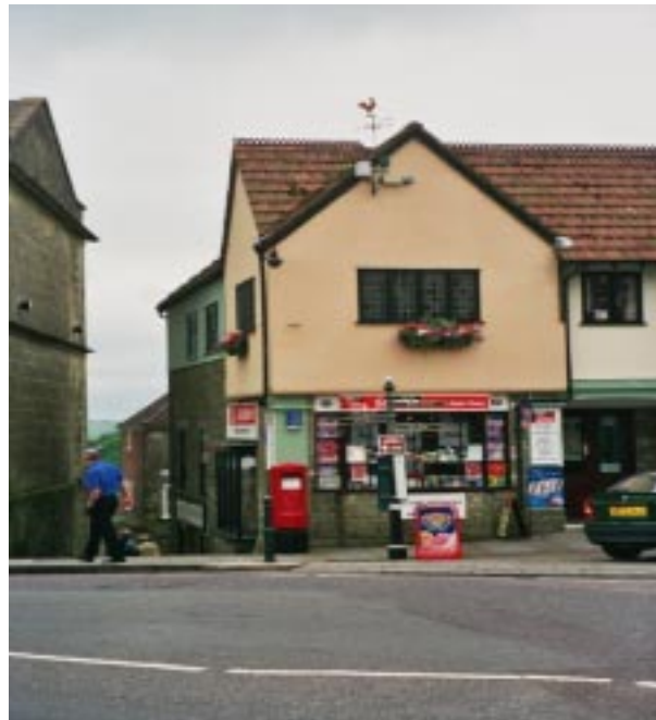
Entrance to Gold Hill

The Action Plan supports the objectives within the SDCC's 'Policy and Strategy Statement 2005-2020' and will work to assist the SDCC in developing schemes and initiatives which forward and help to realise these economic objectives.