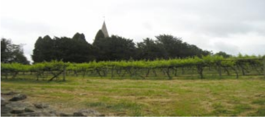
Forthill Gifford Vineyard

Concerns were expressed throughout the consultation process about the future of farming in the area. Nearly 6% of the local workforce is in agriculture and the Action Plan supports the principle that the industry has a continuing role to play in maintaining the countryside on which much of the area's appeal and tourism economy relies.