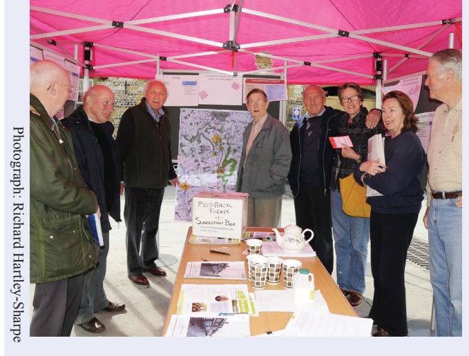
Feedback opportunities for residents