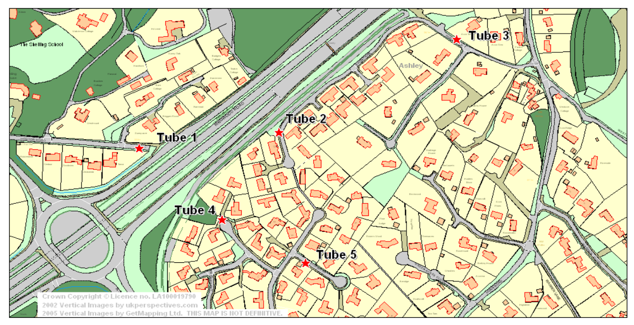
Figure 2 NO2 Tube Locations- A31

The council operates 15 \text{ NO}_2 diffusion tubes sites within its district. These locations are show in Figures 2 to 5, with site details given in Table A.2.