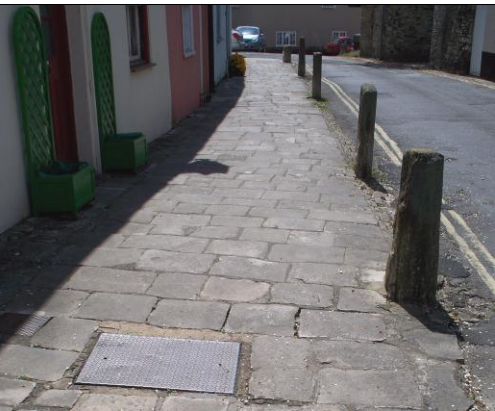
FIG. 12: Historic paving schemes. Left: surfaces adjacent to the old brewery, Pound Lane. Right: paving with stone lined gutter and stone bollards between St John's Hill and Church Green. Both have been damaged by road works.