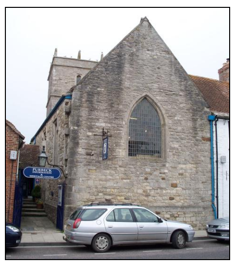
FIG. 3: Medieval fabric. Left: an arched doorway built into the wall of the Old Rectory, Pound Lane; thought to be derived from the castle. Right: former Holy Trinity Church with fourteenth century nave; sole survivor of several small churches built in Wareham during the medieval period.

North Street adjacent to the crossroads, this eventually undergoing some infill by semi-permanent buildings which were damaged and cleared following the fire of 1762. A second market place existed at St John's Hill which apparently served the pig trade, though the proximity and relationship of this to the quay - otherwise a focus of economic activity – is of note. The period saw construction of a number of chapels and churches: St Andrew's (subsequently Holy Trinity - FIG. 3), St. Michael's (previously in St Michael's Road), St. Johns (on the site of the old police station at St John's Hill and apparently infilling part of the market place), St. Peter's (on site of the town hall) and All Hallows (on the site of 19 North Street). This may have reflected population growth though may also have reflected prosperity in terms of the benefaction of separate landowners. All the ecclesiastical buildings (including St Martin's) had fallen redundant and or been demolished by the nineteenth century. Whilst the growth of dissenting sects is likely to have been a contributory factor this may also reflect a decline of the town both absolute and relative at the end of the period following silting of Poole Harbour and accompanying loss of sea trade.