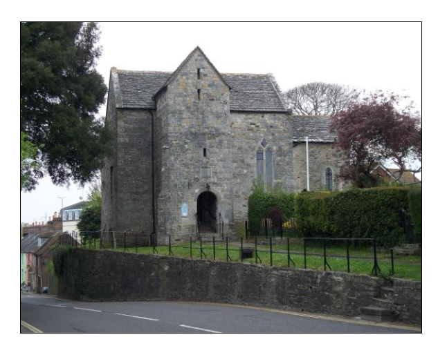
FIG. 1: St. Martin's Church. The oldest building in Wareham standing high above the town's former northern gate (or 'port').

It has been suggested that the street 'grid' which characterises the layout of Wareham was based upon the Roman model of town/military planning, a number of settlements elsewhere in Wessex having been adapted to pre-existing Roman layouts (see Bond and Aston, 1976). The balance of the layout appears to show a bias toward the southern side and quay. Whilst not all the streets within Wareham can necessarily be given a Saxon provenance, and excavation has suggested at least some movement in street dimension over time Wareham is notable as an early example of post-Roman central planning. The area delineated by the walls was not completely or substantially home to a permanent population – large parts of the interior remaining substantially undeveloped until the late nineteenth century – though provided capacity to absorb people from surrounding areas.