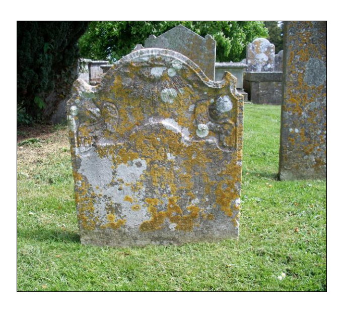
FIG. 20: Churchyard lichens. A colony of lichens viewed on one of St Mary's eighteenth century monuments. The monument above depicts two carved angels beneath a sunburst.

Certain parts of the conservation area are notable for their ecology. The walls represent a vestige of unimproved grassland rich in wild flowers and grasses attractive to insects. They have recently been cleared of trees and are subject to an on going management programme. The churchyard is home to an array of attractive lichens which have colonised tombstones albeit obscuring the inscriptions (see FIG. 20 below). There would perhaps be scope to manage the grass cutting regime in the currently well manicured churchyard to encourage wildflowers. Jackdaws are a common feature around the town where they frequently nest within chimney pots.