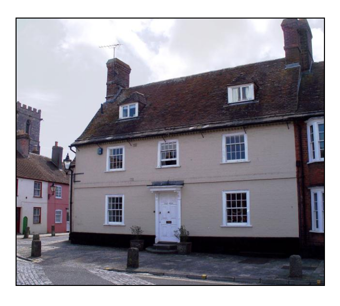
FIG. 14: Three bay format. A configuration three bav expressed at varying scale is common amongst eighteenth century properties. This example in St.John's Hill displays various 'typical' features (e.g. dentil course, stone easing course, hipped dormers, bracketed canopy - multi pane sashes though the windows appear unusually squat). A stuccoed example is shown in FIG. 8.

The substantial rebuilding of the core of Wareham during the late eighteenth century and relatively limited redevelopment since this time has given Zone 1 a predominantly 'Georgian' architectural character; a background against which both earlier and later buildings are usually easy to discern. In this regard North Street, as the least afflicted by fire and the most redeveloped of the main streets is the least homogenous architecturally. It is important to note that the presence of shop fronts even at the centre of the town does not represent an aspect of original architectural character, and though the earliest of these do date to the first half of the nineteenth century the majority of buildings were designed and intended to serve as dwellings. Most of the best/largest houses were located close to the centre though relatively unaltered if less pretentious outliers do still occur in the St John's Hill area (FIG. 14), parts of East Street and the upper reaches of West Street. A three bay configuration, often stuccoed, provides a common template for houses of various sizes. Details such as cornice, parapet and quoins are variously applied (see FIG. 8).