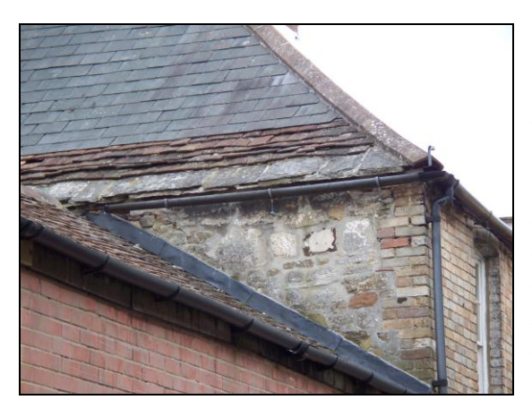
FIG. 16: Material palette. The rear of 8 West Street displays a range of materials and change over time. A fragment of the original tile covering with stone eaves course survives the rest replaced by slate. A bracketed gutter has been added. Whilst the frontage (FIG 8) is stuccoed, flank and rear walls reveal brick and stone construction which might suggest incorporation of older material within the post-fire rebuild.

The historic vernacular in Wareham was thatch, though stone also appears to have been used for buildings of substantial construction and higher status. This may have helped them to survive the 1762 fire. Few thatched roofs now remain, this due to constraint in the use of thatch following the fire, subsequent demolition or the substitution of thatch with solid roofing materials - such as in the case of Nos. 1 Pound Lane, 37-39 East Street, and the store by the quay. It is interesting to note that contrary to popular belief the use of thatch appears to have continued in Wareham after the fire, and even within the zone marked as destroyed in the survey of damage produced after the event - examples here being No.1 Church Lane (constructed after the fire) and the store by the guay. As elsewhere in the District the local thatching style sees use of a simple flush ridge (e.g. No.1 Church Lane), though the post war fashion for installing block ridges decorative features which stand proud with either straight cut or patterned edge persists within the conservation area. Relative proximity to the reed beds of Poole Harbour may have supported localised use of water reed for thatching historically.