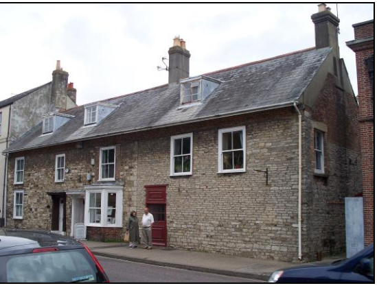
FIG. 4: Buildings of the seventeenth century. Left: 15-17 North Street. Right: 14/14a North Street. It seems likely that the whole of the roof of 15-17 was covered with stone originally, while the slate on 14/14a represents one nineteenth century alteration amongst others (render has clearly been removed from the frontage).

than the bulk of contemporary structures. 1694 saw establishment of a dissenters chapel (later Unitarian Church) in Church Lane, this later rebuilt and enlarged.