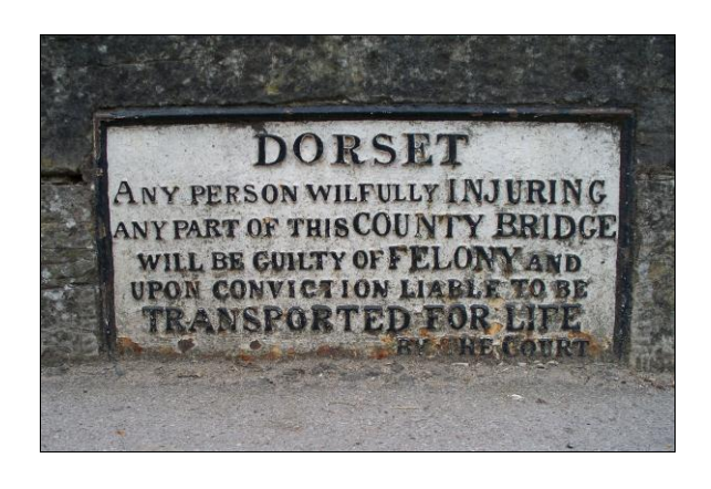
FIG. 11: Historic cast iron sign. Attached to South Bridge. In comparison modern signage erected by the highways authority lacks interest or attractiveness.

erected adjacent to the walls at the end of West Street directing traffic to Lady St Mary School a particularly poor example.