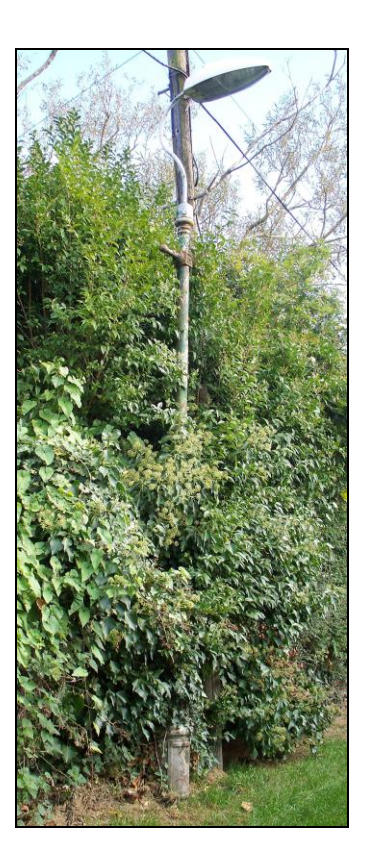
FIG. 13: Historic lamp columns. Currently in Tinker's Lane though soon to be removed.