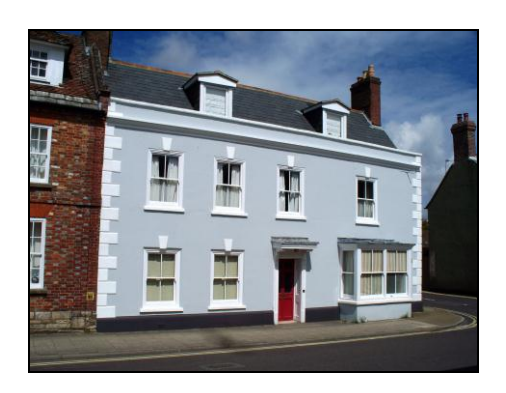
FIG. 15 : Stuccoed frontage. A good example of a frontage with parapet, quoins and keystone detailing, though the struck ashlar jointing is no longer very clear. The historic treatment is unlikely to have been pale blue while the bay, dormers, four pane sashes and roof covering all represent later alterations.

Stucco was fashionable during the late eighteenth and early nineteenth centuries, and appears as a relatively frequent, and in most cases original frontage treatment. Where present stucco is normally crisply applied and lined out in imitation of ashlar, though years of repainting and patching have often obscured the lines. The recently renewed stucco of Pound House provides a useful guide to the original appearance. Historic painted finishes were generally stone coloured, though more garish treatments have become popular (e.g. Nos. 56-64 North Street), and this together with textured paint (e.g. 49 North Street) and pebble dash has spoiled the appearance of some properties and groups. In cases such as Nos. 10/10a North Street, 8 West Street and 29 East Street (FIG. 15) stucco forms part of a frontage treatment which includes heavy quoins, parapet and cornice. Renders such as pebble dash occur infrequently and are here a twentieth century introduction of little merit.