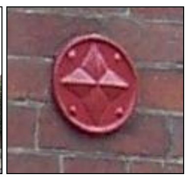
FIG. 5: The gentry in Wareham. Left: plaque recording an endowment by Drax and Pitt. Centre: Gould's 'Manor' House. Right: Plaque of Calcraft's Rempstone Estate. Both the house and plaque are shown in the current estate livery.