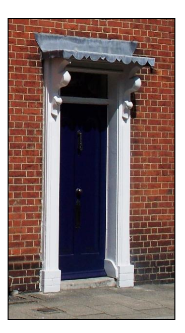
FIG. 17: Door cases. Left: Pilasters with broken pediment and blind fanlight. Centre: bracketed canopy displaying a full entablature with transom light below. Right: simple flat roofed bracketed canopy with transom.