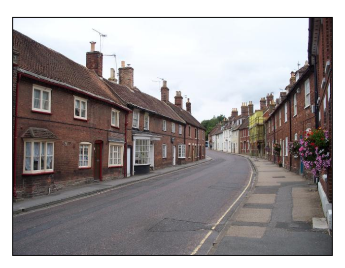
FIG. 2: The castle ditch recalled. The curve of West Street, merging into Trinity Lane recalls the line of the castle's outer bailey ditch. Note the visual interest this provides as buildings climb up the slope.

Excavations show that the completed castle comprised a substantial keep of limestone banded with heathstone, the fabric of which later represented a likely source of masonry employed in building around the town. The second great Norman addition was the town's South Bridge, a feature demolished during the eighteenth century. The period saw Wareham continue in importance though its strategic importance may have waned following the building of Corfe castle. Whilst playing a role in the civil wars of the twelfth century the castle passed from royal hands during the thirteenth. The filling of its ditches at this time allowed for recolonisation of the south side of West Street beyond Trinity Lane.