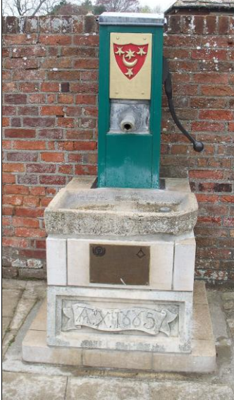
FIG. 19: Pumps. Left: Bamford's pump on Abbot's Quay. Right: Water pump on South Street.