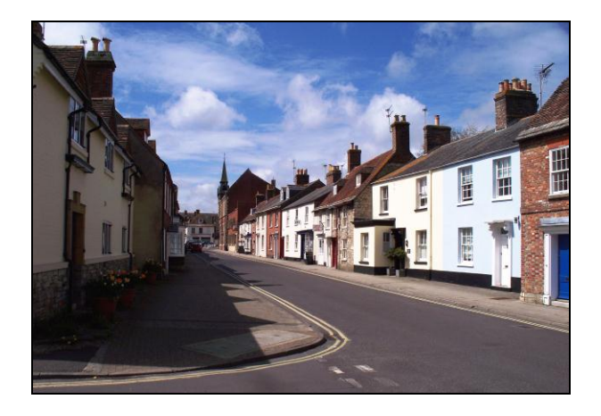
FIG. 7: East Street viewed toward the centre. Of primarily residential character (though with evidence of former shops) with generally similar ridge heights though with some variation in pitches between slated and tiled roofs. The frontage breaks up further east reflecting the historically sparse pattern of development here.

Principal streets are arranged on a cruciform plan supported on a loose grid of secondary streets, the latter having the historic and often continuing status of single track back lanes. Similar character is held by Trinity and Pound Lanes though both represent deviations from what is assumed to have been the original Saxon street grid in this area (see Section 4). Aside from a widening of North Street and West Street at the centre the road structure opens up at three principal points to form irregular public spaces – the Quay, Church Green and St. John's Hill – spaces whose existence reflects past historic activity at these sites (e.g. market, dockside etc). Continued survival of the Saxon street pattern is of significance across the whole conservation area but particularly so within Zones 2 and 3 which otherwise lack any great architectural interest.