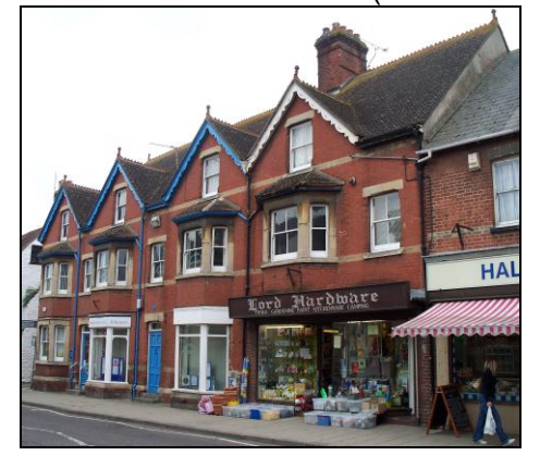
FIG. 6: Late nineteenth century development. A feature most frequent in North Street. The terrace pictured in part replaced the medieval All Hallow's Chapel which stood at the junction with Cow Lane.

The period saw loss of Wareham's political importance one parliamentary seat cut in 1832 (Great Reform Act) and the other, along with the constituency, in 1885. A commentary of 1897 continues to note Wareham's 'decline' at this time partly also blaming the railway which effectively bypassed it in 1847. Throughout the period sporadic infilling and redevelopment of properties took place across the core of the town, this normally recognisable stylistically set against the preponderance of Georgian architecture. A cluster of notable contributions from the first half of the period occur in the south western quadrant of the town and include the brewery house on Pound Lane (the brewery itself was substantially rebuilt during the