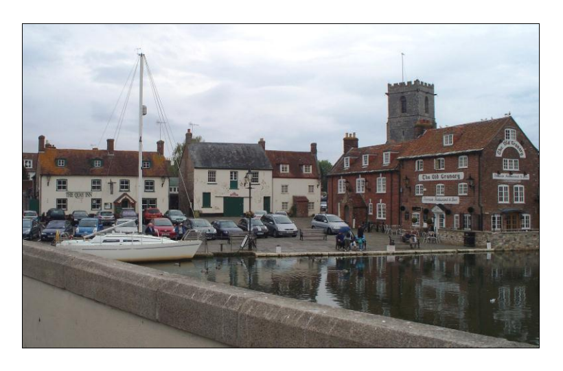
FIG. 10: The Quay viewed from South Bridge. A classic view. The Old Granary formerly served as a warehouse as too the annexe to the Quay Inn (centre). As with many other spaces within Zone 1, cars dominate.

The Quay with St.Mary's behind as viewed from South Bridge (FIG. 10) provides a composition of particular quality spoiled a little by the elevated dining area to the rear of the Old Granary. Passage down West Street from the centre provides particular interest by virtue of the combination of a continuously enclosed street edge with changing topography and street line. The gently rising ground level and the deflection of West Street (FIG. 2) combined with narrowing street width and the abrupt transition from town houses to cottages provides visual stimulation through a varied and unfolding view. Similar visual interest is provided by the curve of Pound Lane around the Brewery House, in contrast to North, East and South Streets whose more linear nature allows views along most of their length from the centre. The prominence of St Martin's approached from either side of the walls on North Street is an arrangement of particular and quite probably symbolic historic note.