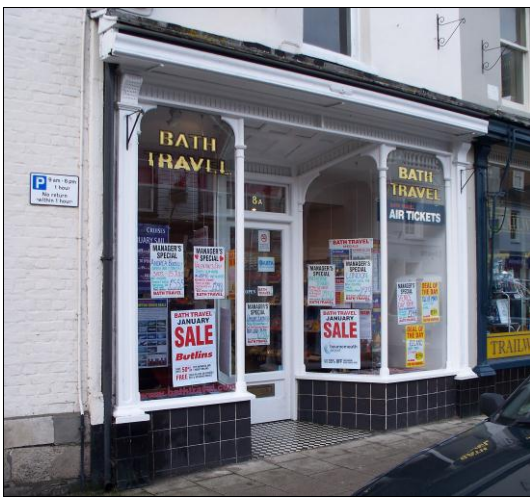
FIG. 18: Shop fronts. Left: early nineteenth century bow window serving a former shop at No 6 East Street. Right: Late nineteenth/early twentieth century shop front at No 8 South Street – note tiling and threshold mosaic.