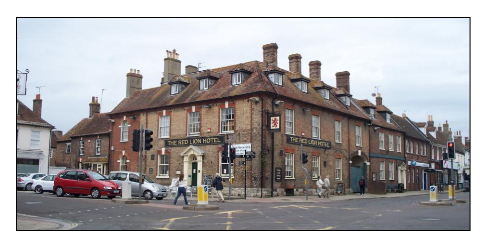
FIG. 9: The Red Lion. A building with strong presence whose bulk in form is balanced by vertical emphasis in detailing and softened by hipping of roofs. The building brings important definition to the corner. The broad gap between this and the town hall was occupied by buildings providing market functions prior to the fire. The location is now dominated by traffic. Note use of buff brick.

Towards the centre of the settlement town houses are characterised by broad frontage, three bay double pile plans. Moving out towards the ends of West and North Street stature noticeably drops as an increase in narrow fronted row houses, often of shallow plan, is seen. Similar types are frequent in East Street and in the St.John's Hill/Church Street area. All types have often been enlarged through addition of rear extensions usually at right angles to the host property, though sometimes set parallel and integrated through use of an 'M' shaped roof. Grain is generally fine though a number of buildings hold a relatively high individual bulk. Amongst historic examples of the latter the Red Lion exerts a major presence befitting of its prime location and historic function (see FIG. 9), whilst the blunt and uninteresting frontages of Nos. 16 and 45-51 sit less comfortably within the street scene. Amongst more modern building the Rempstone Centre (Sainsbury's) has a surprisingly low impact within the townscape, unlike Anglebury Court whose form, layout and bulk is wholly negative.