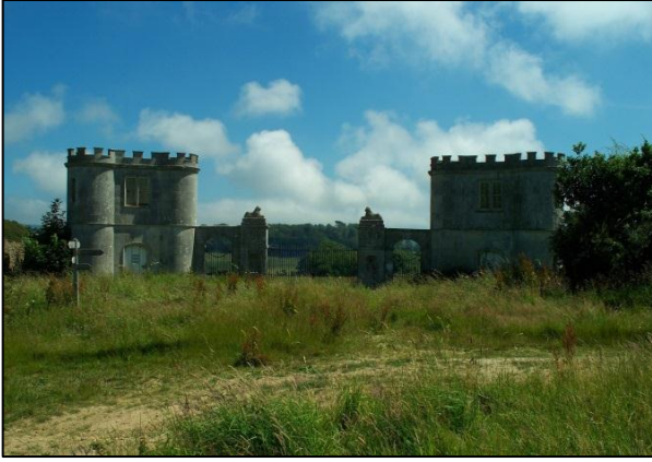
FIG. 12: Clare Towers and North Lodges. Clare Towers (right) is a 'Gothic' styled northern entrance to the park, whose heathstone construction is more visible since concealing ivy has been removed. This has also clearly exposed the poor condition of the structure. Higher quality Portland ashlar is used at North Lodges to the east (right), though flanking towers and walls are constructed from heathstone. This building is also in poor condition and on the Historic England 'at risk' register.