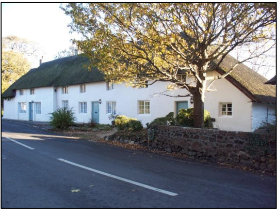
FIG. 13. Render. Wareham Lodge (left) has a flat, formally lined out self-coloured render. This may have been introduced when the structure was moved. Nos. 6-8 (right), which includes the old post office, carries a more informal protective render more typical of the vernacular.