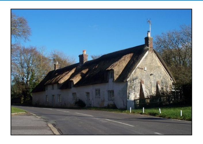
FIG. 15: Nos.14-16 Main Road. As elsewhere in the village the thatched roof has been renewed. Old photos show a heavy accumulation of what was almost certainly straw thatch, within which the dormers were far less prominent.