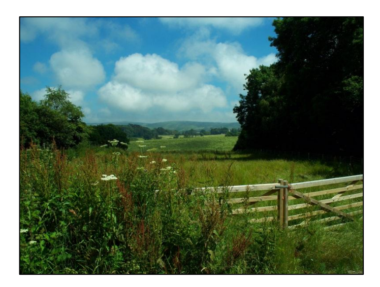
FIG. 9: View across Lulworth Park from Clare Towers.

46. Numerous views across and within the rolling parkland are particularly good (see FIG. 9), and can be experienced through use of the permissive footpaths. The visual connection between the castle and North Lodges is appreciable despite the distance between.