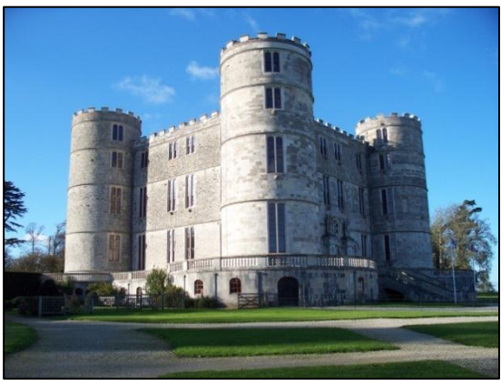
FIG. 3: Buildings of the seventeenth century. Left: Manor Cottage, which is shown on the 1770 map in FIG. 4. The decorative banding of limestone and heathstone is especially notable. Right: the castle, originally built as a hunting lodge, became the dwelling of the Welds in the mid-seventeenth century.

22. Following a short period of inherited ownership by the Earls of Suffolk, most of the estate was purchased by Humphrey Weld in 1641, the year in which the Civil War broke out. Bindon House was destroyed during the war, with both the castle and