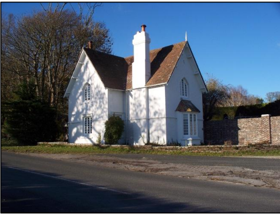
FIG. 11: St. Mary's Chapel and Garden Lodge. The chapel (right) has the appearance of garden pavilion and stands on the edge of rolling open parkland across which North Lodges (see FIG. 12) is visible in the distance. Garden Lodge (right) has a more distinctly Victorian, neo-Gothic pattern book style.