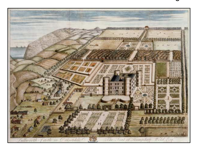
FIG. 1: Lulworth Castle and gardens c.1721. Whilst not at all cartographically accurate, the view provides a good impression of the organisation, design and use of the park at this time. The formal gardens and village are shown as they existed prior to the remodelling, clearance and landscaping which took place in the late eighteenth-early nineteenth century. Deer still occupy the two fields to the north showing that the original function of the park continued, albeit on a lesser scale than previously.

11. Significance principally lies in the outstanding collection of closely associated heritage assets (scheduled ancient monuments, listed buildings and registered park) contained within the boundary of the conservation area. Together these illustrate the evolution of the village and park over a period of eight hundred years, telling a story of changing social relations, fashion and the rural economy, whilst the settlement itself retains the character of a small estate village.