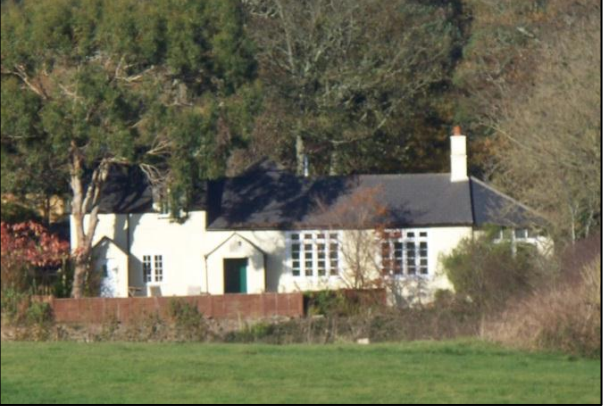
FIG. 6: The nineteenth century schools. Unusually for such a small settlement, East Lulworth once contained two schools. Right: the Elementary School c.1840. Left: St. Mary's Catholic School c.1855.

32. Comparing maps between 1889 and 1902, three former 'common' houses (see paragraph 28 above) appear to have been removed during the period.