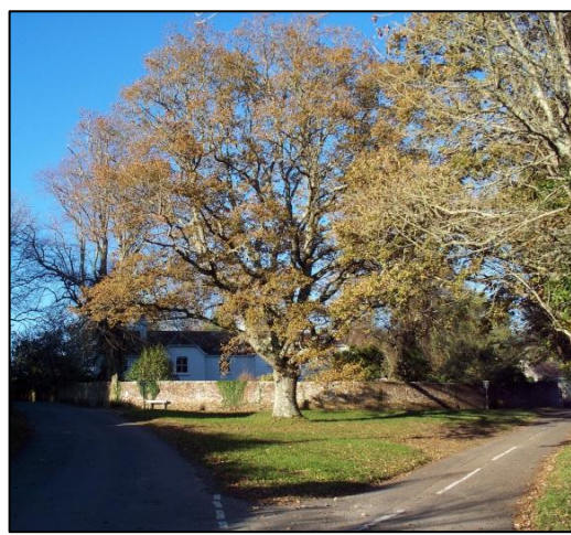
FIG. 10: Notable trees. Left: a spreading oak outside the former St. Mary's School. Right: oak tree on the green at Mount Pleasant – a fragmentary vestige of what was once East Lulworth Common.

52. Around the village woodland at the edge of the park provides a continual backdrop, whilst small patches of damp woodland also occur at other points (see FIG. 14). Amongst individual trees, the large oak growing outside the former St. Mary's School, and that on the green at the entrance to Mount Pleasant are of note (see FIG. 10 above). Clumps of trees planted on the green opposite the old post office, and at the entrance to Cockles, are attractive features. The 1770 estate map shows that the latter space was at that time occupied by a building.