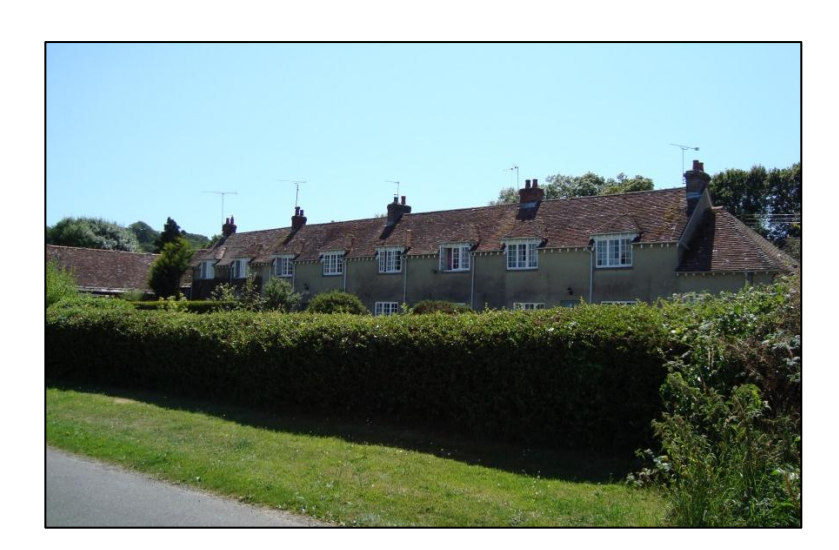
FIG. 16: Nos. 51-54 Shaggs. A distinctive terrace of cottages carrying the date stone 1792.