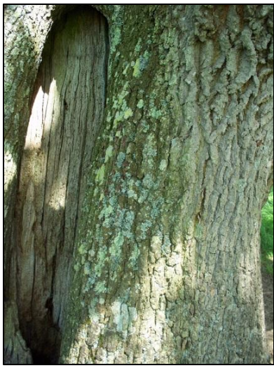
FIG. 17: Woodland ecology. Left: Hart's Tongue and other ferns and mosses are common within damp woodland around the conservation area. Right: lichens on the trunk of a tree in Lulworth Park

79. The conservation area and its immediate setting are particularly rich in woodland, alongside which garden, open green spaces and the small stream which runs along the road at Cockles provide variety. In places the visual character of the conservation area is considerably softened by growth of mosses, and ferns are common (see FIG. 17 below).