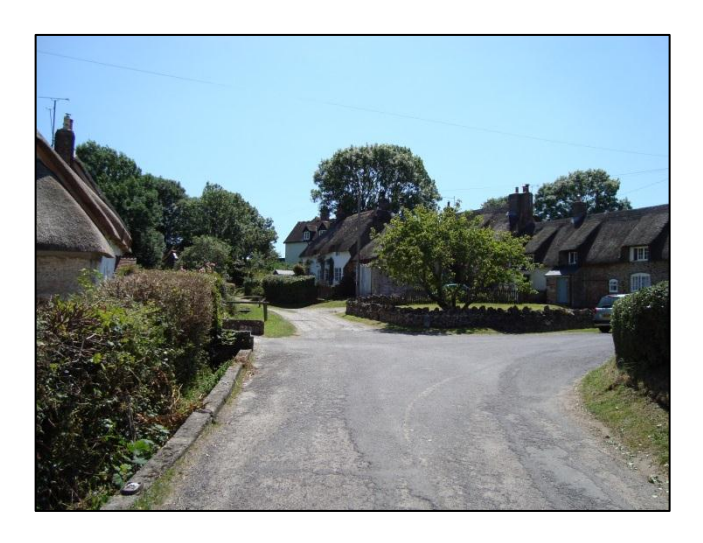
FIG. 7: Cluster of cottages at Cockles.

35. The current layout of the village (Zone 1) was in large part fixed by the end of the eighteenth century, at which time the principal eastern half was cleared to form the park. In the western part of the village buildings formed four distinct but loosely dispersed clusters, and subsequent development has occurred around and to a lesser extent between them. Three of these clusters (centred around the old post office, south eastern end of Cockles and the Weld Arms) are located around a looping road formed by Cockles and Main Road, with houses at Mount Pleasant forming a detached group. Modern development between the clusters, and mostly notably along Cockles, has obscured the historic layout, though the latter nonetheless remains distinct. Cottages at Shaggs and Park Lodge sit outside the main village structure and are more closely related to the layout and organisation of the park.