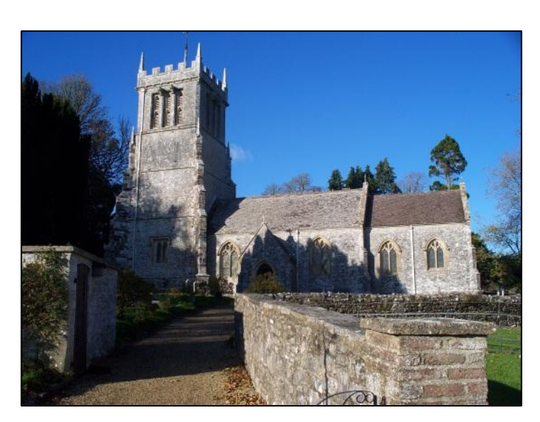
FIG. 2: St. Andrew's Church. The fifteenth century tower is of note, the rest of the church dates to the late nineteenth century. The de Newburgh's manor house is thought to have stood close by.

18. A 1770 estate map shows the open strip fields associated with East Lulworth (and typical of medieval peasant farming) were arranged to the south of the village, whilst a common existed to the north and north east of the area now known as