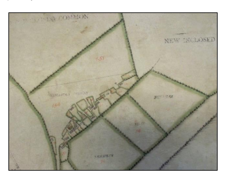
FIG. 5: Houses at Common Hill, later Mount Pleasant (D/WLC/P1.7). The 1770 estate plan shows a tight cluster of irregularly laid out buildings. Drawn shortly after the enclosure of East Lulworth Common, the houses are shown bordering a scrap of "unenclosed" land, whilst to the north and east new fields have been formed. Four of these buildings survive, one ruinous.

28. In 1770 the area currently known as Mount Pleasant, but at that time as 'Common Hill', sat on the edge of what had been the East Lulworth Common (see FIG. 5 above). A Bill of 1761 allowed the common to be enclosed with the bulk of land assigned to the Welds. A surviving fragment was used for the construction of Nos. 32-5 and adjacent buildings, though even in 1840 small scraps of unenclosed common are recorded as surviving. Of these, the triangular 'green' seen upon entering Mount Pleasant (see FIG. 10), and the broad verge to the front of Nos. 32-5 remain as relics. The 1770 map of the common labels dwellings at Mount Pleasant 'the common houses', and it seems credible to suggest that this was because the grouping which then existed were 'encroachments' (i.e. buildings informally constructed on common land). The position at the edge of the common, detached from the main part of the village, and the dense and irregular layout of what appear to be tiny houses, may support this theory. Estate surveys indeed confirm that the construction of dwellings on the common and 'waste' (uncultivated land) was taking place in the village during the eighteenth century.