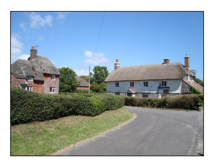
FIG. 14: Cottages at Cockles. No.17 (left) is a visually eccentric building with unusual form and varied palette of materials, including hanging tiles. Nos.18-19 (right) have a more typical form and are constructed from cob on a high rubble stone plinth.

71. Roof forms show a mix of pitched, hipped and half hipped forms. A mixture of all three is seen at the Lindens, whilst the most unusual but interesting roof form is that of No. 17 Cockles. Whilst no overall consistency is shown relative to the materials used, thatched roofs more commonly have hipped forms than pitched. Modern replacement of the roofs of thatched buildings with dormers has had a marked impact upon their appearance when compared to old photographic images. This is particularly seen at No. 14-16, where a shallow, flat covering of water reed had replaced a thick multi-layered covering (see FIG. 15).