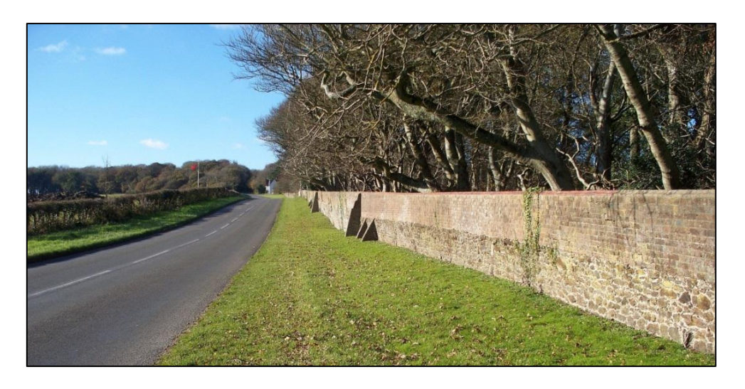
FIG. 8: The park wall. A major feature of enclosure within the conservation area, generally built on a masonry plinth (variously heathstone and or limestone with occasional flint), raised in brick adjacent to roads.

41. The most striking boundary feature within the conservation area is the park wall. With the exception of gates, this forms a continuous roadside feature on the route between Coombe Keynes and Burngate, and encloses much of the park.