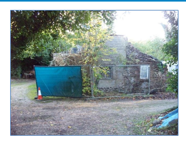
FIG. 18: Buildings at risk. No. 37 Mount Pleasant – little of this listed building appears to survive.