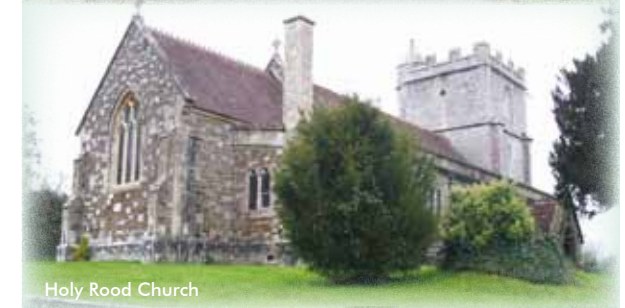
Holy Rood Church