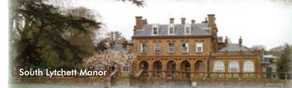
South Lytchett Manor