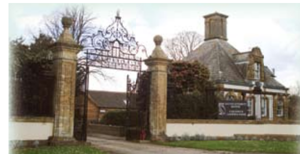
Former lodge and gateway to South Lytchett Manor

The Character Appraisal document is available for reference at Upton Library, the District Council offices and may be downloaded from our website: www.purbeck.gov.uk