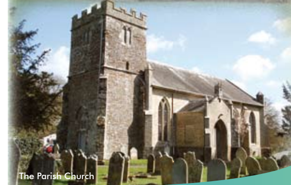
The Parish Church

Planning Services, Purbeck District Council, Westport House, Worgret Road, Wareham, Dorset, BH20 4PP. Tel: 01929 556561. Web: www.purbeck.gov.uk