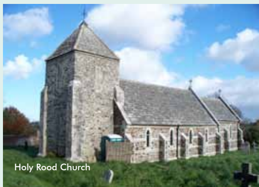
Holy Rood Church

Coombe Keynes Conservation Area was first designated during 1990, and was reviewed in 2015. A character appraisal has been adopted.