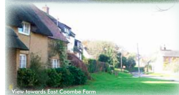
View towards East Coombe Farm