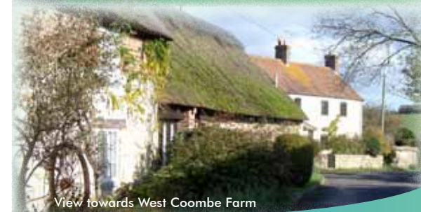
View towards West Coombe Farm

Planning Services, Purbeck District Council, Westport House, Worgret Road, Wareham, Dorset, BH20 4PP. Tel: 01929 556561 Web: www.dorsetforyou.com