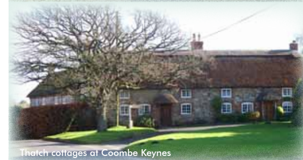
Thatch cottages at Coombe Keynes