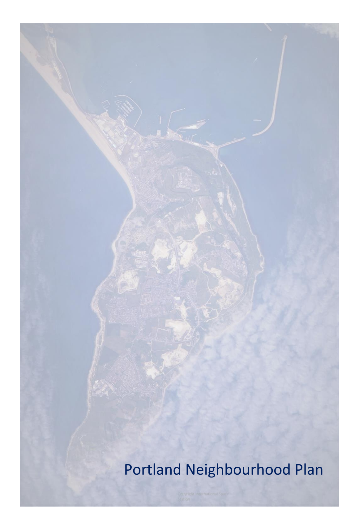
Basic Conditions Statement