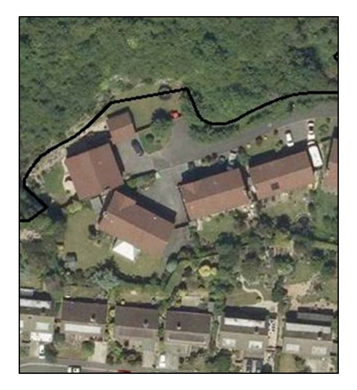
Figure 1: Cuts through garden (settlement boundary in black)

16. Figure 1 below shows how the local authority has drawn a settlement boundary that cuts through a property's garden and then arbitrarily runs parallel to the road, without following any physical boundary that would be easily identifiable on the ground. It would be more logical for it to follow the garden fence and the inside edge of the road, as they are more recognisable/permanent features.