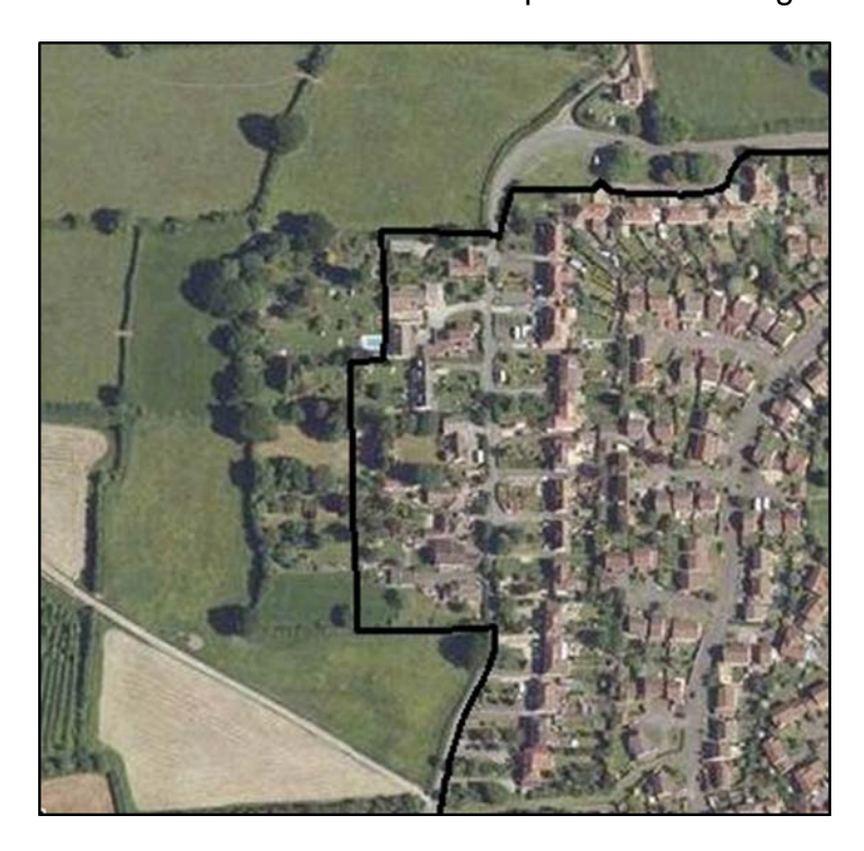
Figure 2: Exclusion of part of the rear gardens (settlement boundary in black)

field boundary/bottom of the gardens would be easily identifiable as a boundary, this does not outweigh the benefit of preventing development or a proliferation of domestic outbuildings that could lead to an undesirable sprawl of the village.