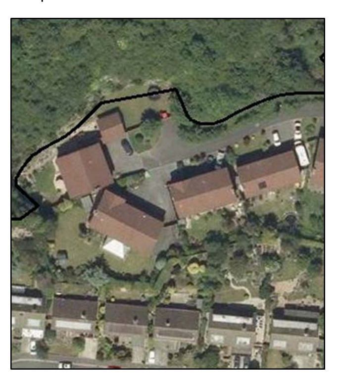
Figure 1: Cuts through garden (settlement boundary in black)