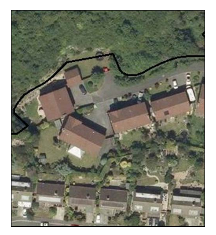
Figure 1: Cuts through garden (settlement boundary in black)

23. Criterion (b): relationship with the urban area. There is an important judgement to make between balancing the permanence of the feature with whether or not the feature is an appropriate edge to the settlement. For example, it would not be appropriate to identify a road or an ownership boundary that contains a large garden as a permanent