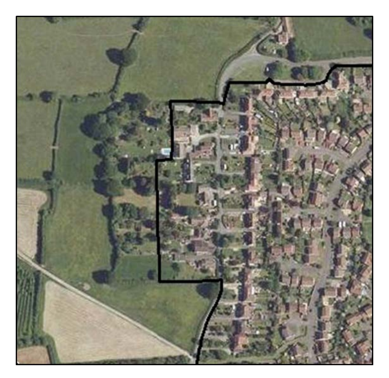
Figure 2: Exclusion of part of the rear gardens (settlement boundary in black)

26. In the long term, there may be an argument that nothing is truly permanent. However, local plans usually have a lifetime of around 15 years, which means that settlement boundaries will be reviewed when the next plan is prepared. Therefore, it is unlikely that the general extent of boundaries would change over such a relatively short period of time. But the fact that there is potential for physical features such as hedgerows to weaken over time, or be removed altogether, shows the importance for reviewing settlement boundaries to ensure that they are as robust as possible.