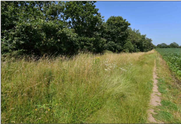
FIG 1. SY7632 8832. Field margin in northeast of field with tall grassland grading into scrub with young trees