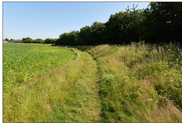
FIG 4. SY7593 8822. West-southwest margin with tall grassland grading into Bramble and then a mature hedgerow. The grassland and field margin has Wild Parsnip and Fleabane which important nectar sources for invertebrates.