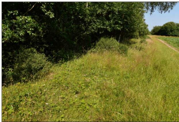
FIG 3. SY7599 8828. Field margin in northwest of area. Shorter and slightly acid in character with Common Cat's-ear, Common Centaury and Bird's-foot-trefoil.