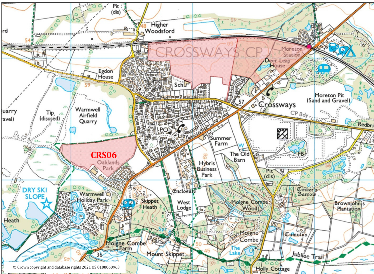
MAP 1. Site location

This report forms part of a suite of ecological surveys commissioned by Dorset Council's Strategic Planning and Natural Environment Teams. Together the survey reports form part of the evidence base for the Local Plan, containing extended Phase 1 survey information for the potential allocated sites, highlighting important habitats and the likelihood of protected species being present. The surveys have been carried out by Dorset Environmental Records Centre who are working with Dorset Council to ensure that ecological data for the Local Plan process is as up-to-date as possible.