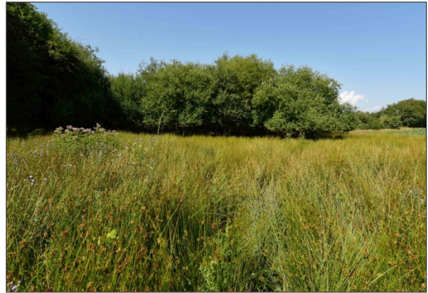
FIG 2. SY7619 8827. Seasonally wet area dominated by Soft Rush