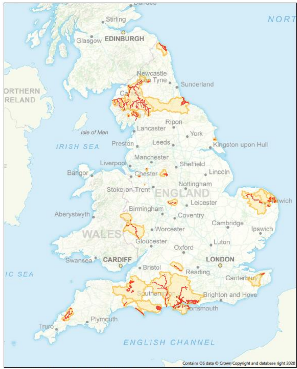
Annex B: National Map of Catchments

European protected sites requiring nutrient neutrality strategic solutions Nutrient neutrality SSSI catchments