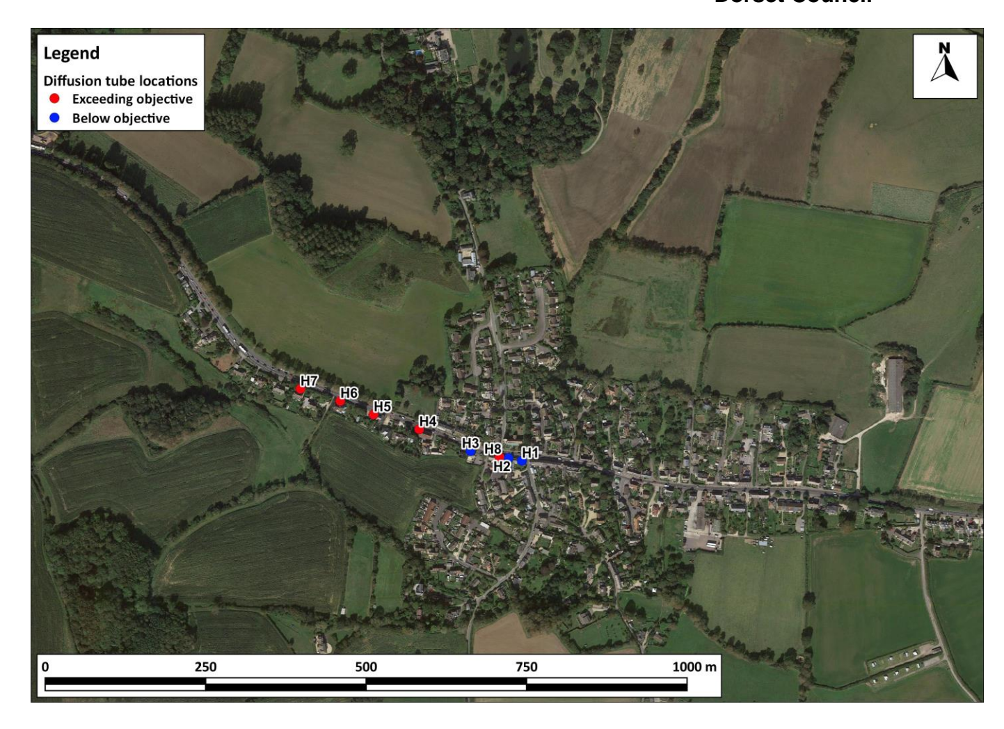
Figure 3: Location of Highways England Nitrogen Dioxide Monitoring in Chideock, showing exceedances in 2019

This AQAP focuses on Chideock with measures to reduce emissions on the A35. Although the focus of the LAQM regime is to achieve the air quality objectives at hotspot locations such as in Chideock, it is also recognised that in order to improve the health of residents more widely, a reduction in emissions of both NO<sub>2</sub> and particulate matter (PM)<sup>4</sup> more widely across the district would have greater benefit. Exposure to air pollution over a period of years is thought to be the strongest driver of health impacts. However, current legislation and policy do not deal with exposure effectively. Exceedances of targets, such as air quality objectives, provide the clearest means of communication but do not reflect the evidence that there is no "safe" level for air pollutants such as PM<sub>2.5</sub> and probably NO<sub>2</sub>. This AQAP therefore not only provides actions specific to Chideock, but also provides more strategic