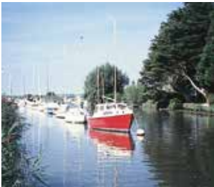
Lulworth Cove Coombe Keynes River Frome