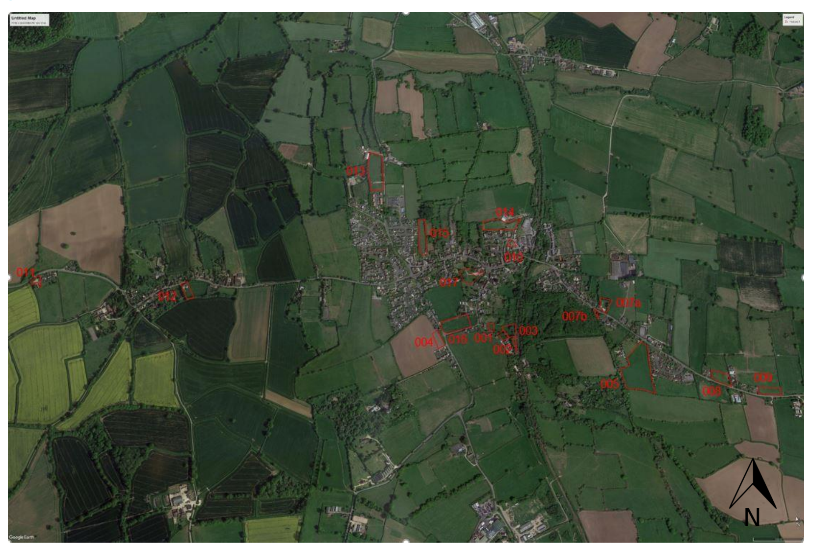
Figure 3: Map of all sites